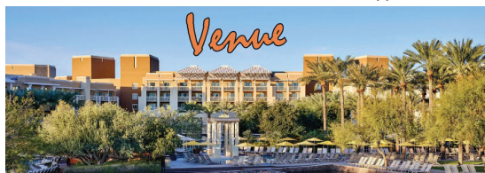
JW Marriott Phoenix Desert Ridge Resort & Spa